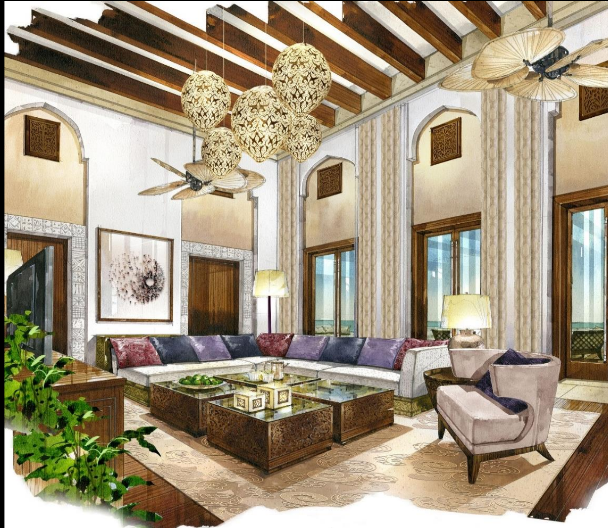
Park Terrace Suite