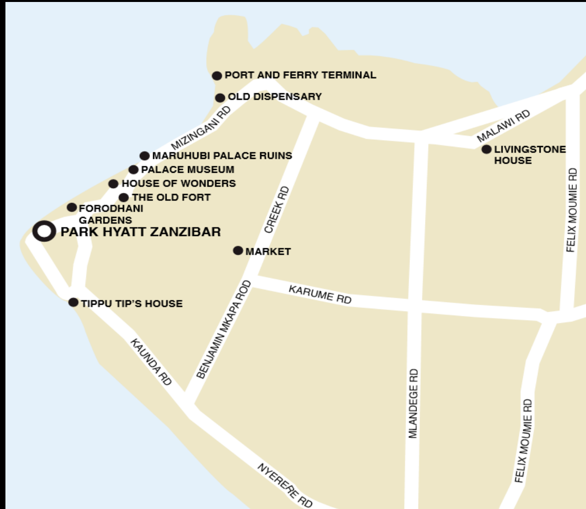
Shangani Street in Stone Town, Zanzibar